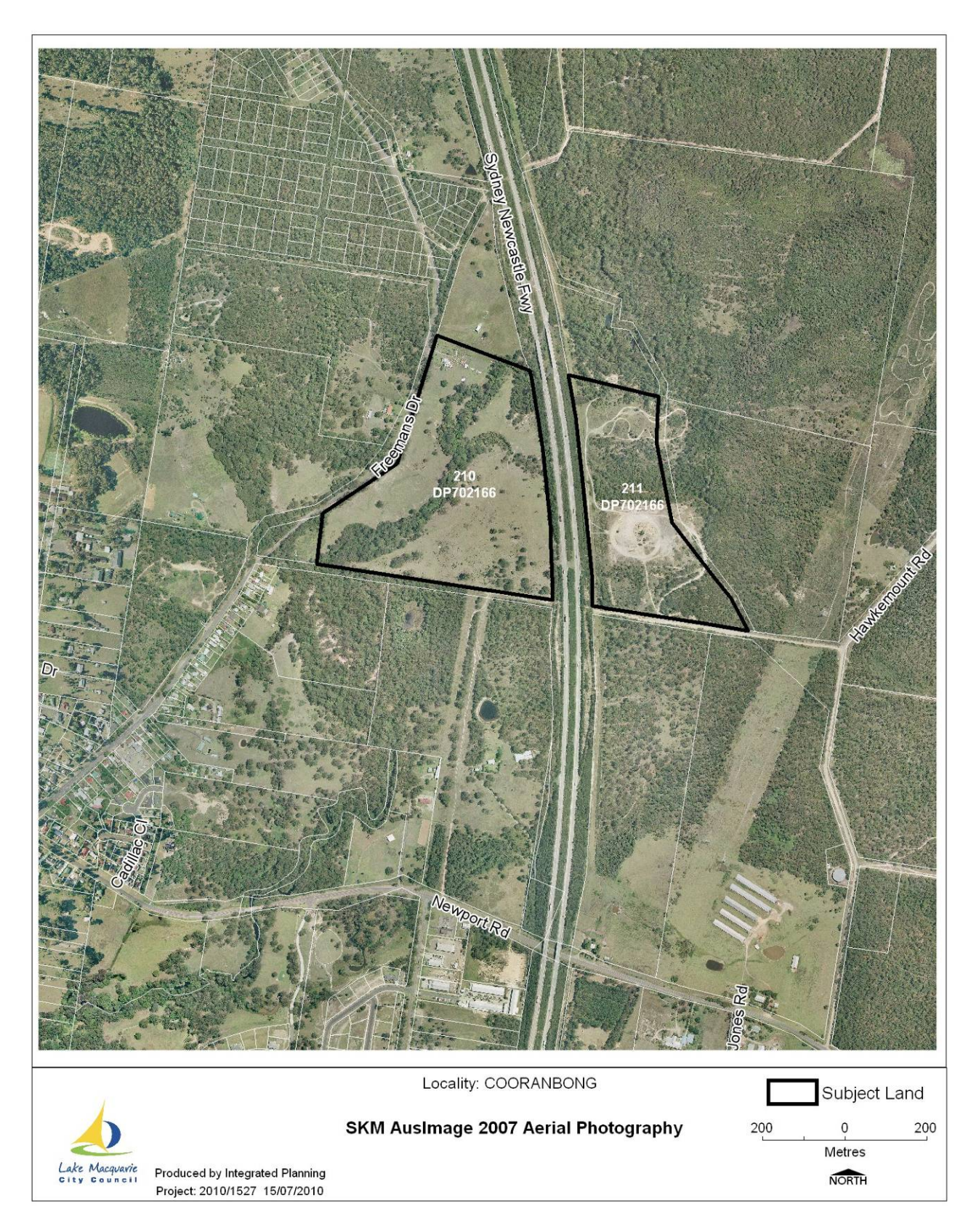
Figure 2 – Aerial Photograph